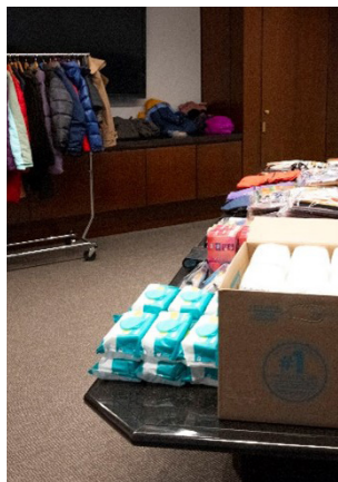
Winter gear, school supplies and toiletries given out to the immigrant children who attended the clinic