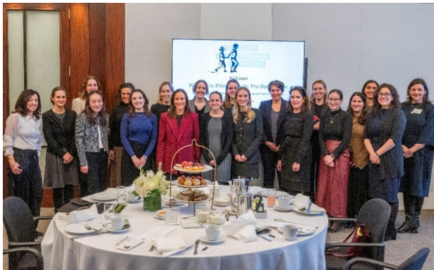
Women in PE Networking Event held prior to the clinic