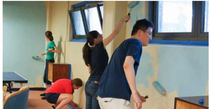
Summer associates stretch high and get low to cover the whole wall in paint.

Summer associates and administrative staff from Simpson Thacher traveled to Eastchester Gardens Community Center in the Bronx on July 5 th with New York Cares to participate in a day of community service. The STB team revitalized four classrooms and hallways with a new coat of paint, a mural, and plenty of paintings to give the walls character.