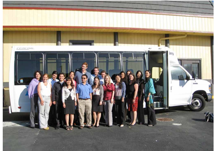
The Justice Bus