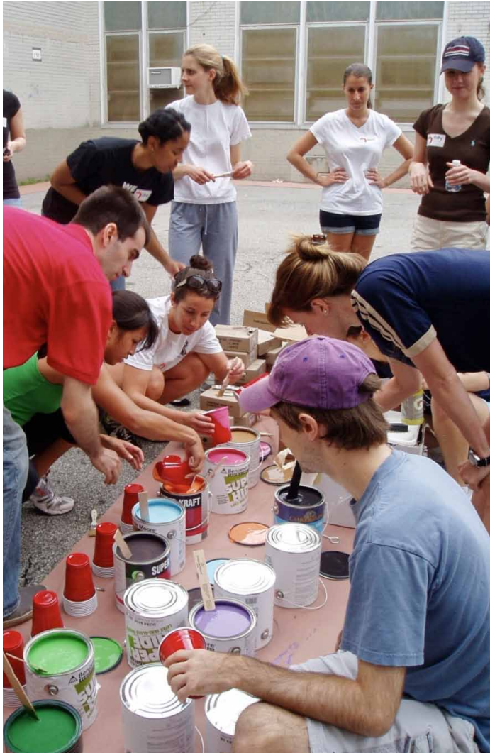
STB Volunteers prepare to start painting!