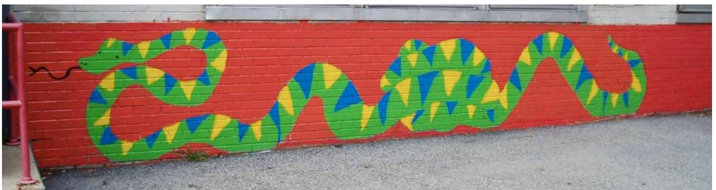
The finished mural brings new life to the courtyard.