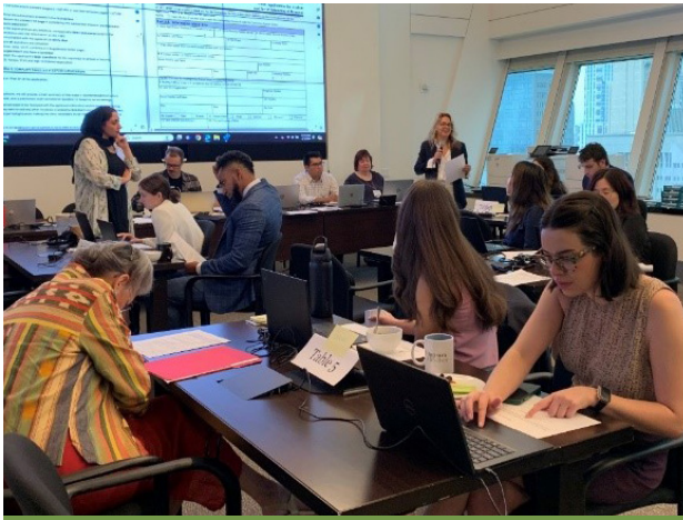
Volunteers in the New York Office receive training before meeting with their pro se asylum applicants