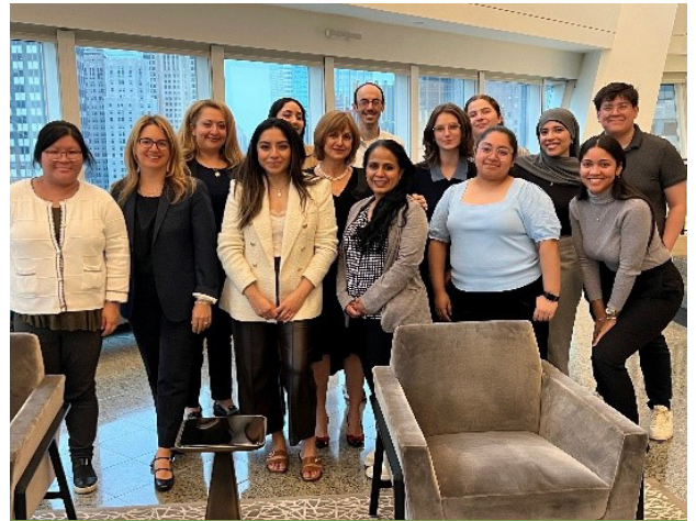
Simpson, NYPLI and CMS staff at the clinic

On April 17, volunteers from Simpson Thacher, Morgan Stanley, and Apollo collaborated with Catholic Migration Services and New York Lawyers for Public Interest (NYPLI) to host a limited scope immigration screening clinic to help determine community members' eligibility for various forms of immigration relief. The participating teams were able to accommodate a range of different languages—including English, French, Spanish, Mandarin, Wolof and Pular. Together, volunteers interviewed 23 community members, many of whom have now worked with Catholic Migration Services to seek further assistance with their asylum applications as well as additional referrals and support.